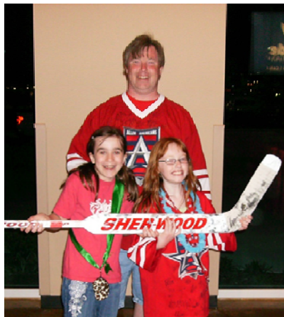
Winner of the goalie stick at the March 26 game.

At the March 22 and March 26 Allen Americans Hockey Team games, the Friends of Library Endowment Board Managers raffled off a team jersey, a goalie stick, and a team banner signed by the 2010 Championship Team, all donated by the Allen Americans.