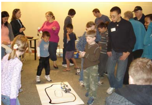
Kids of all ages were fascinated by the robots created by the Lowery Freshman Center engineering group.

Can't wait to hear from you -- contact us soon!!